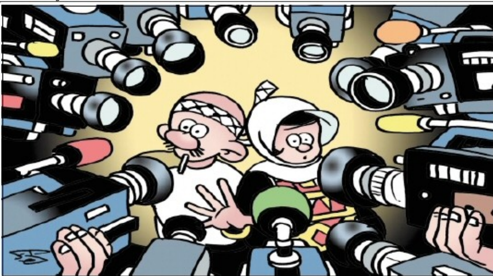
Al Ayyam. Feb. 18, 2006 All eyes on the Palestinians

The best example was Hamas's website, www.alqassam.com , which has been presenting videos of Hamas suicide bombers. In one message, Hamas pledged to drink the blood of Jews until they leave Muslim countries.