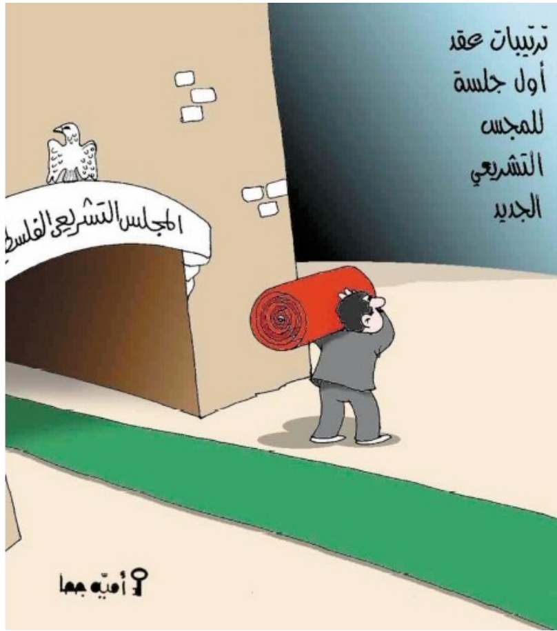
Al Hayat Al Jadida. Feb. 18, 2006 Taking out the red carpet from the PLC and replacing it with the green carpet of Hamas.