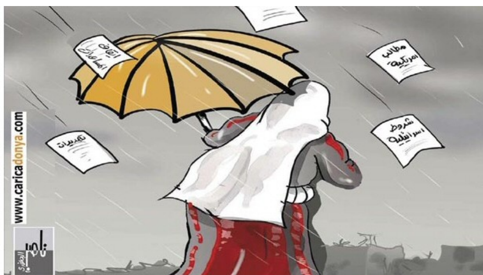
Al Quds. Feb. 17, Demands rain on the Palestinians.