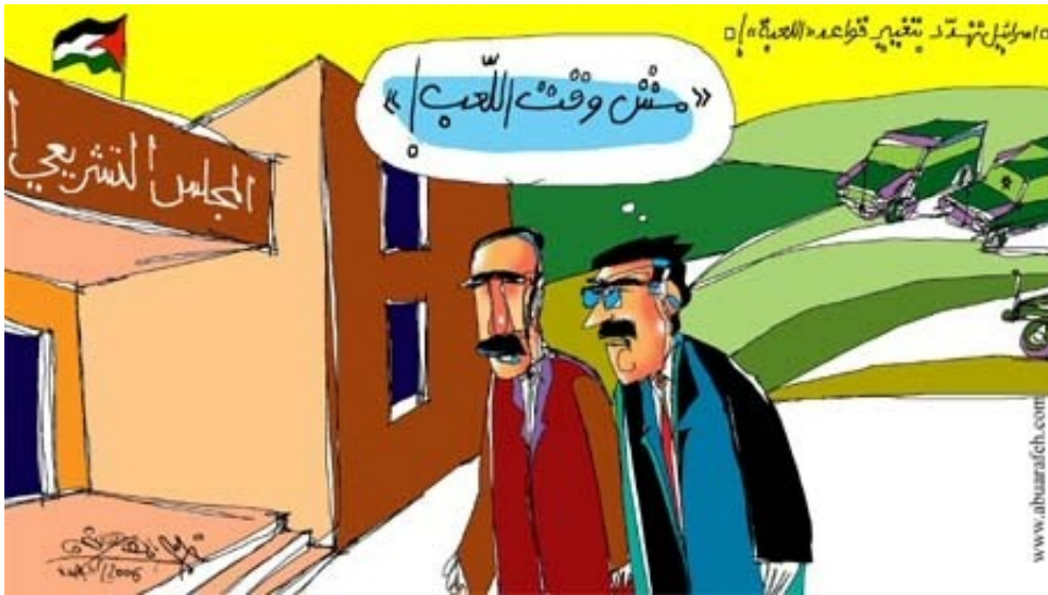
Al Quds. Feb. 17, 2006 Two members enter the PLC surrounded by Israeli troops: 'Let the games begin.'

"One of its fighter groups launched two Al Mustafa missiles towards Israeli military locations, central Gaza Strip," the statement said. "The attack comes in response to continuous Israeli attacks and violence against Palestinian factions."