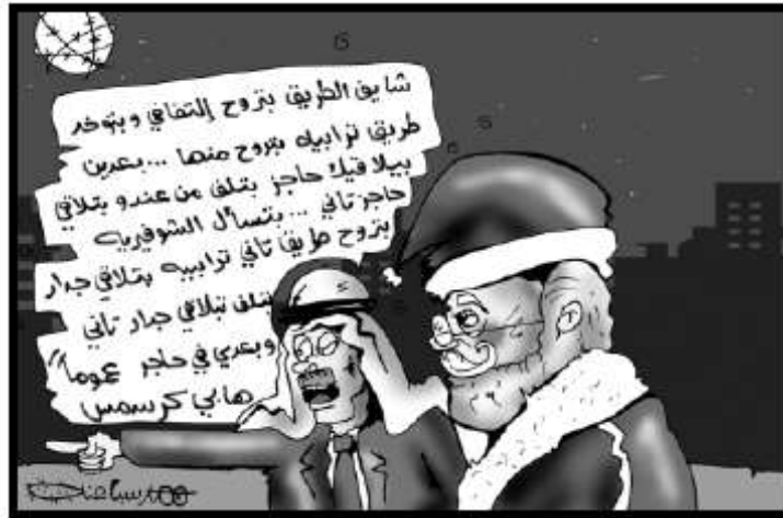
Al Hayat Al Jadeeda. Dec. 26, 2005

Arab gives Santa Claus directions on how to get past Israeli roadblocks to Bethlehem.