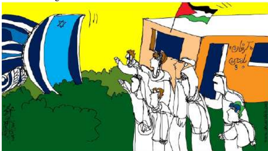
Al Quds. Dec. 23, 2005

This is not the first time, the PA has warned of an Israeli plot to capture or destroy Al Aqsa. Similar warnings were issued in 2000 and 2003.