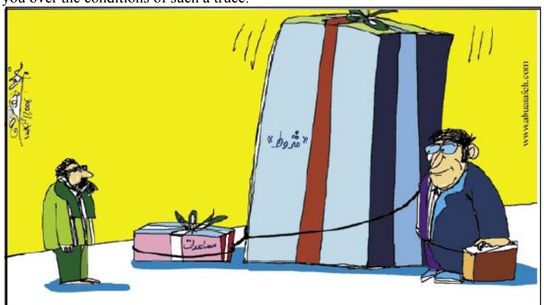
Al Quds. Feb. 1, 2006 Hamas presented with huge conditions for a tiny aid package.

"We will never recognize the legitimacy of the Zionist state that was established on our land," Masha'al wrote in a column entitled "To whom it may concern." "If you [Israel] are willing to accept the principle of a long-term truce then we will be ready to negotiate with you over the conditions of such a truce."