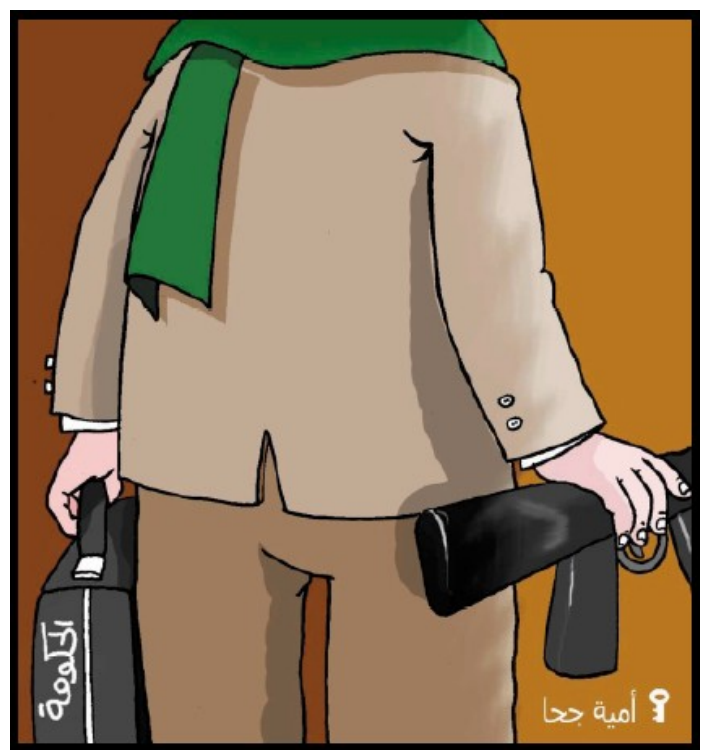
Al Hayat Al Jadida. Feb. 1, 2006 The new PA government: a briefcase and a rifle.

The Wafa report did not consider the target of the Palestinian gunners illegitimate. Wafa said a missile struck a house in Ashkelon, "occupied and seized since 1948."