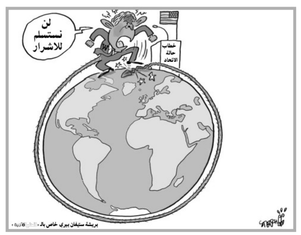
Al Hayat Al Jadida. Feb. 2, 2006 President Bush as the devil: 'We won't surrender to evil.'

The newspaper said that under the plan, Hamas would agree to reduce the powers of the prime minister and the cabinet. The changes would limit the prime minister's role in foreign affairs and security, while strengthening Abbas.