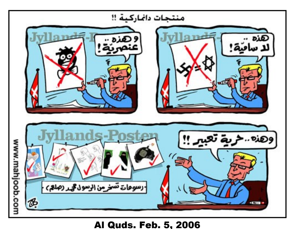
EU diplomat gives lesson on democracy: Banning comparisons of Israel to Nazis while allowing anti-Muslim cartoons.

Another Fatah group, called the Abu Al Reesh Brigades, warned nationals from Norway, Denmark, France and Germany that their lives would be in danger. Abu Al Reesh warned of attacks unless these countries apologized by February 4.