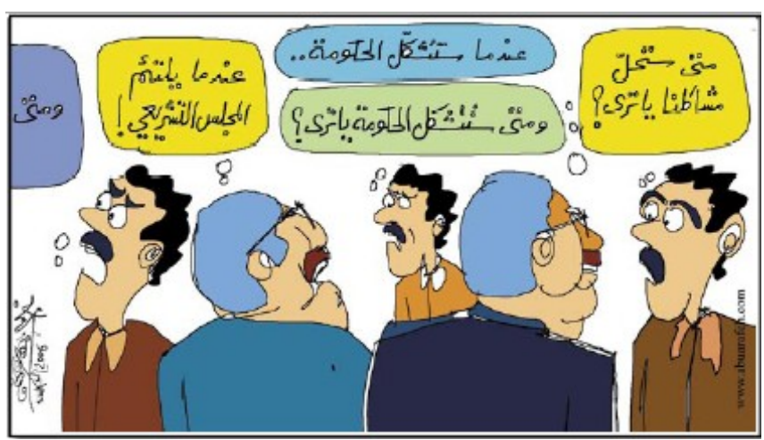
Al Quds. Feb. 5, 2006 Palestinian seeks answer of when the next PA government would be formed.